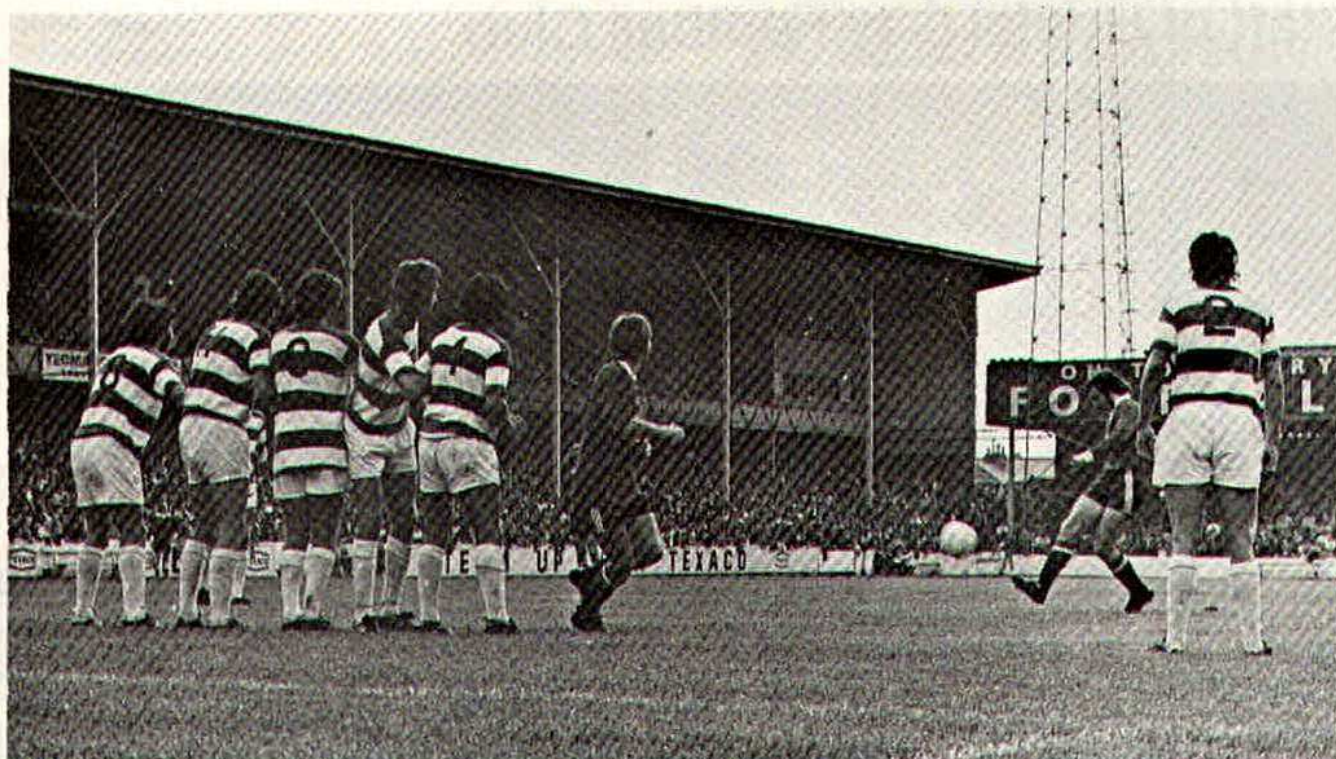
Don Rogers scores the Town's first goal with an accurately placed free-kick from just outside the penalty area.

Steve Peplow makes no mistake with this shot to score goal number two for the Town, following good play by Don Rogers.